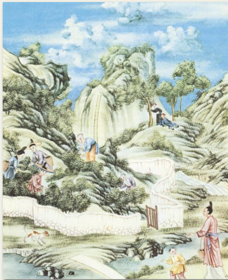
Above (inset): For centuries in China, tea was dried, ground, and then processed into compressed bricks. Left: This watercolor illustrates tea-picking in the typically mountainous regions where the best teas are grown.

China developed the guywan , or covered cup method of steeping and imbibing leaf tea, and also invented the teapot. The first teapots were tiny earthenwares used for steeping oolong tea leaf, a new type of semi-oxidized tea. These were the new ways of tea prevailing in China by the time Europeans made the first direct contacts by sea with China and, inevitably, got their first sip of tea. In 1608 the first tea ever sent for sale in Europe arrived in Amsterdam, half a world away from