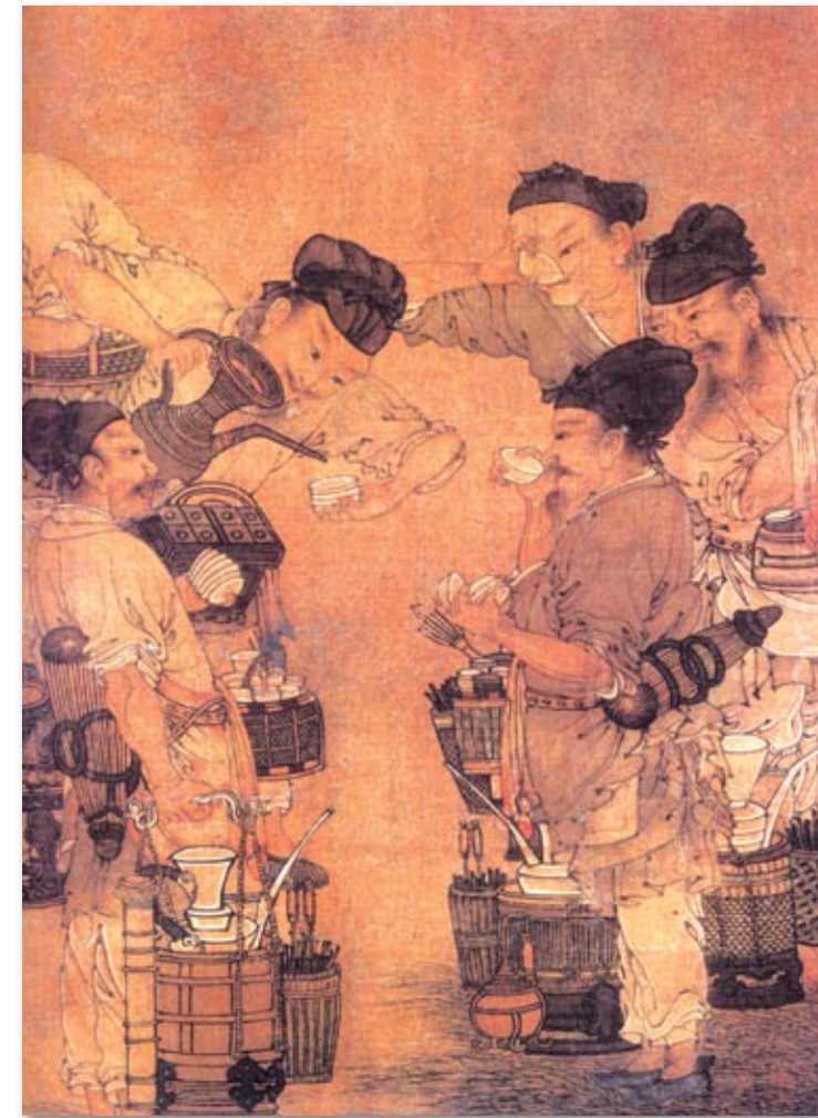
A “tea competition” during the Song dynasty (960-1279). Tea craftsmen competed with each other to determine whose tea would be sent in tribute to the Emperor.

And in every culture it has entered, tea has inspired the best loved of all the applied arts—tea wares. Whether you think of Chinese porcelain, Japanese earthenware, or English silver, it seems safe to say the cult of tea has produced some of the world's finest artisan craftwork—objects intended for us to hold as well as to behold, things to love.